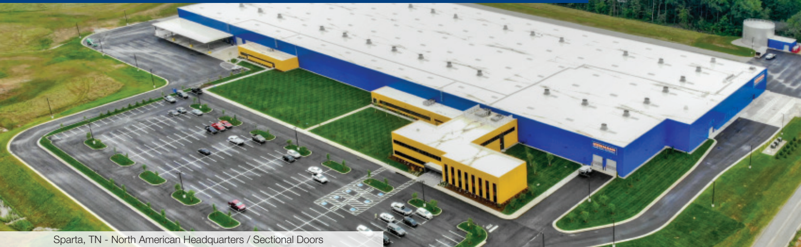
Sparta, TN - North American Headquarters / Sectional Doors