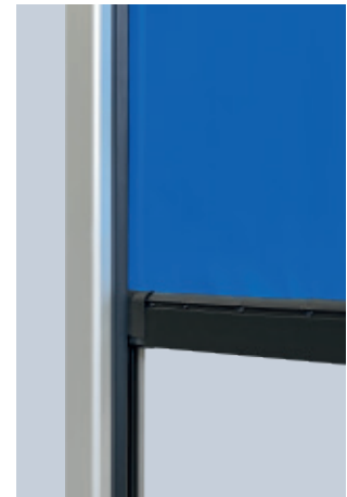
Tight sealing Narrow guide track panel insertion area and draft seals