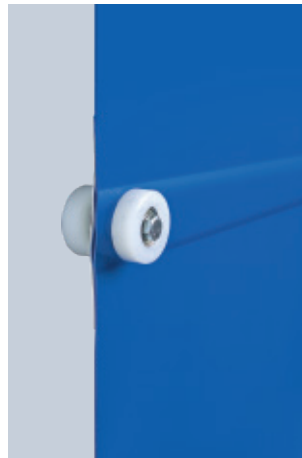
Stable panel Welded panel with spring steel stiffener

For applications that require the control box to be remotely located, our optional remote keypad is the ideal accessory. All control functions are performed through a compact, 3" x 5½" keypad integral on either the left or right guide track. The same functions performable on the door control box may also be performed on the remote keypad including: initial installation set-up, opening and closing, as well as service and troubleshooting.