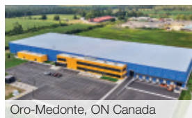
Oro-Medonte, ON Canada