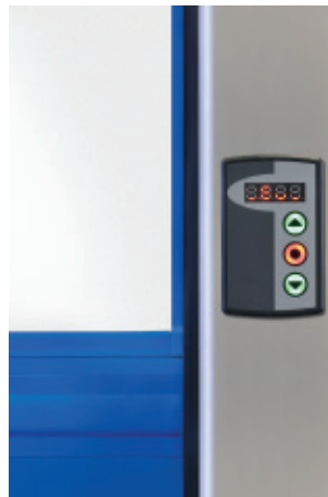
Convenient remote keypad (optional) Access control box functions when the control box is remotely installed